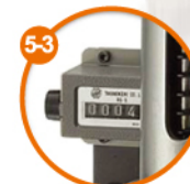
專業型計數器 Equipped with a counter device