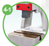
4-1 主軸壓床位置 Arbor press position