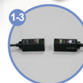
1-3 外掛式安全電眼(需選購) Plug-in electric eye safety (optional)