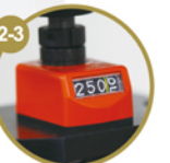
2-3 配備位置顯示器 Equipped with a position indicator