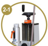
2-1 主軸微調距離 Precise fine tuning and securing arrangement