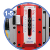
1-5 寬廣的調整範圍 Wide range of adjustment