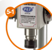
精密主軸結構 Precise principal axis design