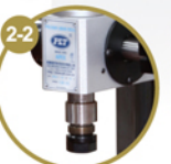
2-2 精密主軸結構 Precise principal axis design