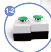
1-2 安全啟動裝置(需選購) Safety start device (optional)