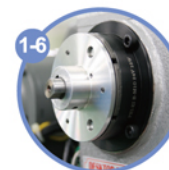
1-6 傳動使用電磁離合器 Transmission using electromagnetic clutch