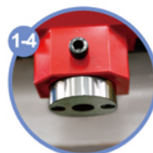
1-4 模頭套筒可依尺寸更換 The size of chuck arbor and sleeve can be changed