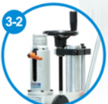
3-2 主軸微調距離 Precise fine tuning and securing arrangement