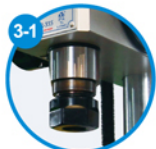
3-1 精密主軸結構 Precise principal axis design