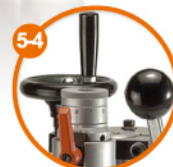
主軸微調距離 Precise fine tuning and securing arrangement