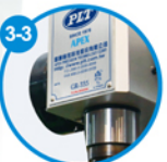
3-3 專利防呆裝置 Patented foolproof device