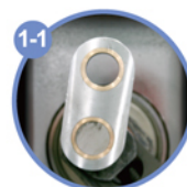
1-1 專利行程可調結構 Patented adjustable stroke structure