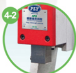
4-2 精密主軸結構 Precise principal axis design