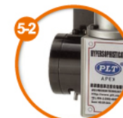
專利防呆裝置 Patented foolproof device